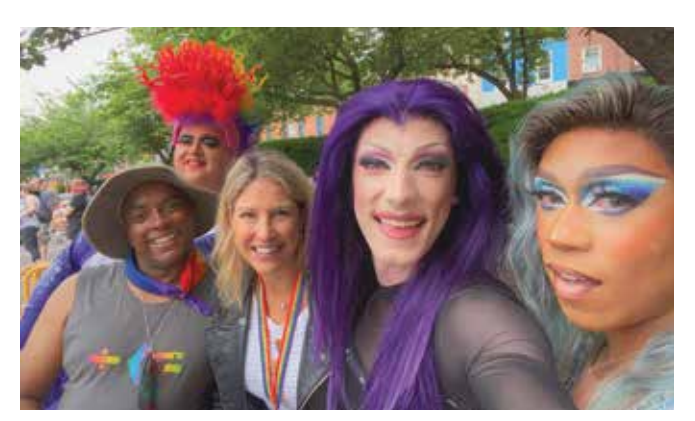
Thank you to the LGBT Equality Alliance of Chester for organizing a wonderful Pride Fest in Phoenixville! I loved seeing so many smiling faces and I'm always happy to show support for equality.