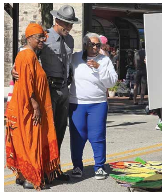
I was honored to celebrate Juneteenth in Phoenixville. Juneteenth commemorates the end of slavery in the United States. This holiday is a reminder that we must remain vigilant – the struggle for justice and equality is far from over.